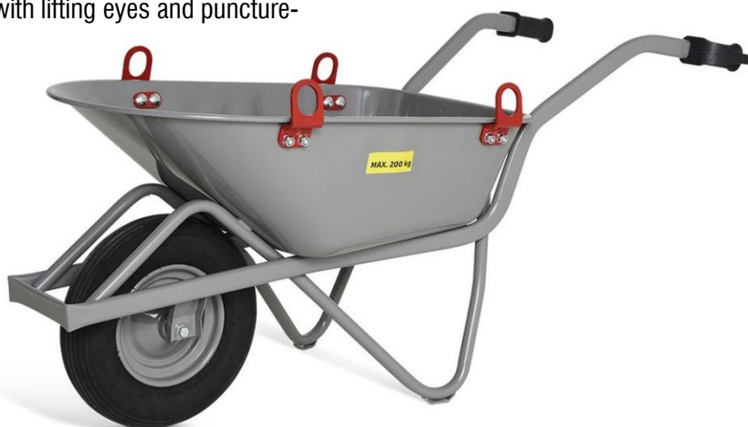
17618 M-115-L4 Lifting eyes