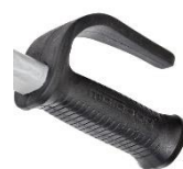
12337 Ergo handgrip with knuckle protection