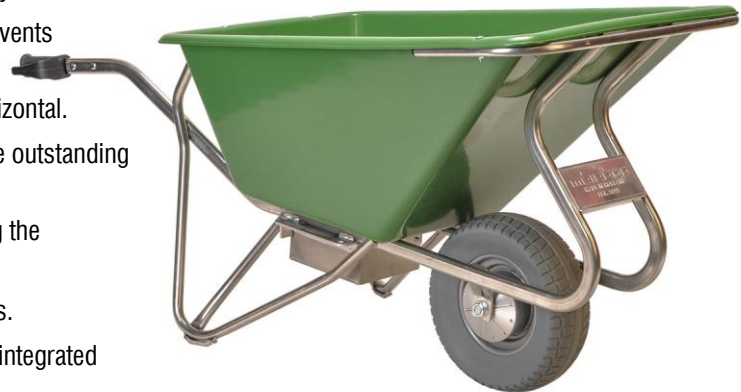
10206 M-E-BARROW NOKA 160

Natural ergonomic rubber handgrip with knuckle protection.