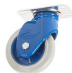
11405 Swivel castor